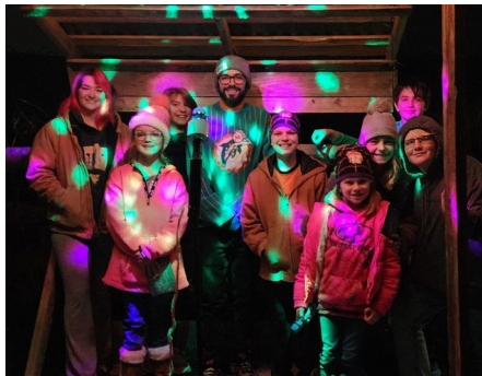
TBA had a great time when they attended Chad's Corn Maze on October 30th.