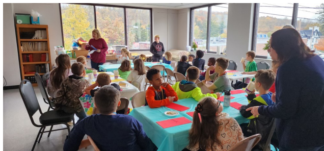
Christian Adventure was very successful with 34 students signed up. Our attendance was in the 20's each week. The spring Christian Adventure will be held February 22 - March 29. More information to come.

Thank you to all those who helped with the Ski Swap on Nov. 12th. $1,145 was raised for the LV Food Bank.