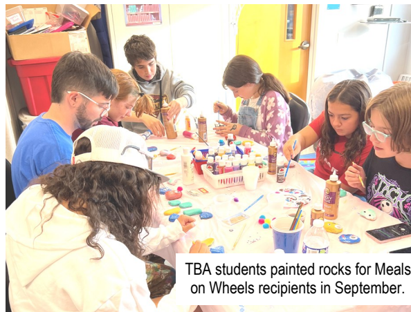
TBA students painted rocks for Meals on Wheels recipients in September.